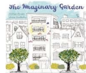
The Imaginary Garden by Andrew Larsen

Find out more about family literacy and upcoming C.O.W. visits online at famlit.ca or call the Centre for Family Literacy 780-421-7323 (Toll Free 1-866-421-7323) Funded by the Government of Alberta