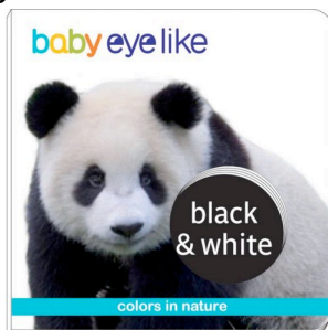
Baby EyeLike: Black & White from Play Bac