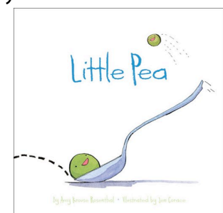
Little Pea by Amy Krouse Rosenthal & Jen Corace

Find out more about family literacy and upcoming C.O.W. visits online at famlit.ca or call the Centre for Family Literacy 780-421-7323 (Toll Free 1-866-421-7323) Funded by the Government of Alberta and United Way "Working together in Alberta"