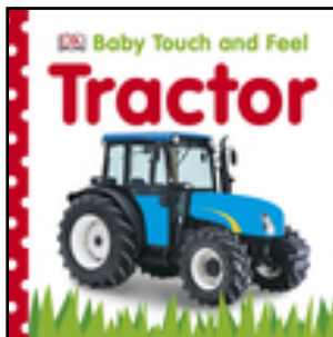
Baby Touch and Feel Tractor from DK Publishers