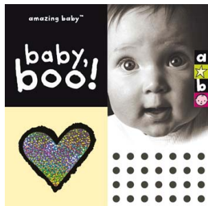
Baby, Boo by Amazing Baby