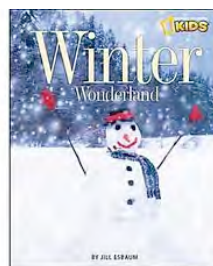
Winter Wonderland by Jill Esbaum