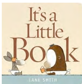
It's a Little Book by Lane Smith