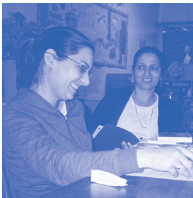
Staff from ABC Child Development Centre, Edmonton, discuss information from the First Steps resource manual.